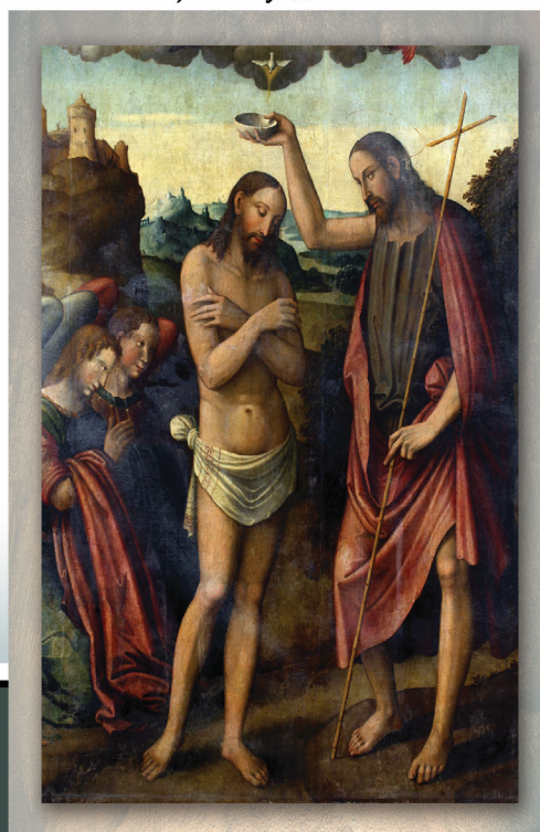
Copyright © J.S. Planch Co., Inc. Excerpt from the Laboratory for Mass © 2001, 1999, 1998, 1975, CCLC.

To reach a priest after office hours in an EMERGENCY situation, such as a death or the need for the Last Rites, please call: (650) 582-5833.