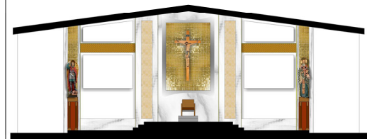
Sanctuary Back Wall Renovation

Nos complace informarle que gracias a sus generosas contribuciones a la campaña de la ADA 2021, podremos comenzar la renovación del santuario de la Iglesia este mes, tentativamente la semana del 10 de enero .