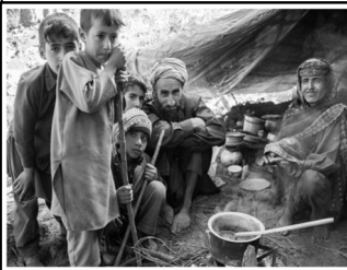
Toward an Ever Wider "We"