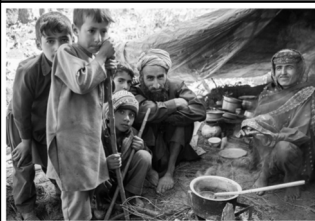
Toward an Ever Wider "We"