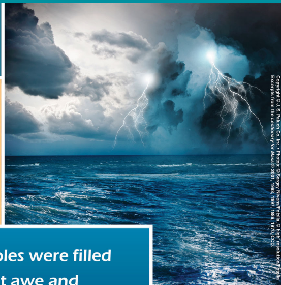
Copyright © J. S. Puhon Co. Inc. Excerpts from the Lectionary for Masses © 2001, 1988, 1997, 1988, 1970, CDB.

The disciples were filled with great awe and said to one another, "Who then is this whom even wind and sea obey?"