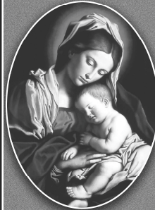
Holy Mary, protect all mothers

Please join us for HOSPITALITY at the Parish Hall On Sunday, May 12, 2019 after the 11:15 AM Mass.